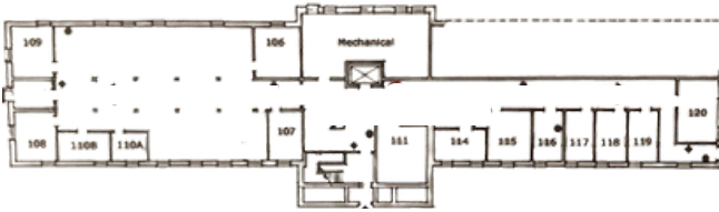
ADRS LAKESHORE FIRST FLOOR